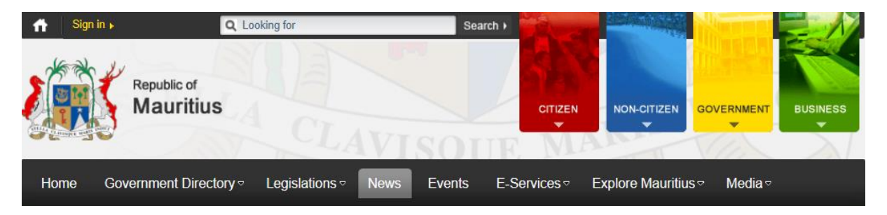
Home > News > Prime Minister meets Chagos Refugees Group Leader on advisory opinion request procedure

http://www.govmu.org/English/News/Pages/Prime-Minister-meets-Chagos-Refugees-Group-Leader-on-advisory-opinion-request-procedure.aspx