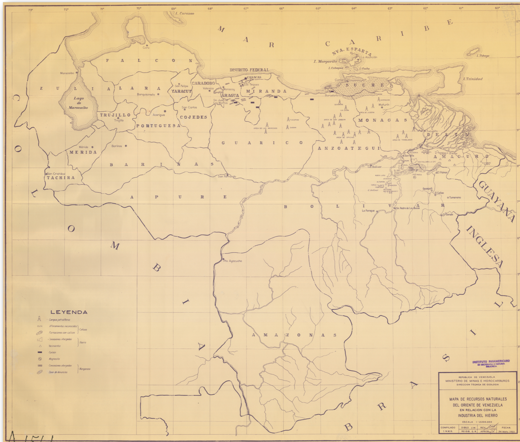
Figure 4.4. [Original Map] United States of Venezuela, Ministry of Mining and Hydrocarbons, Map of Eastern Natural Resources of Venezuela (May 1950)