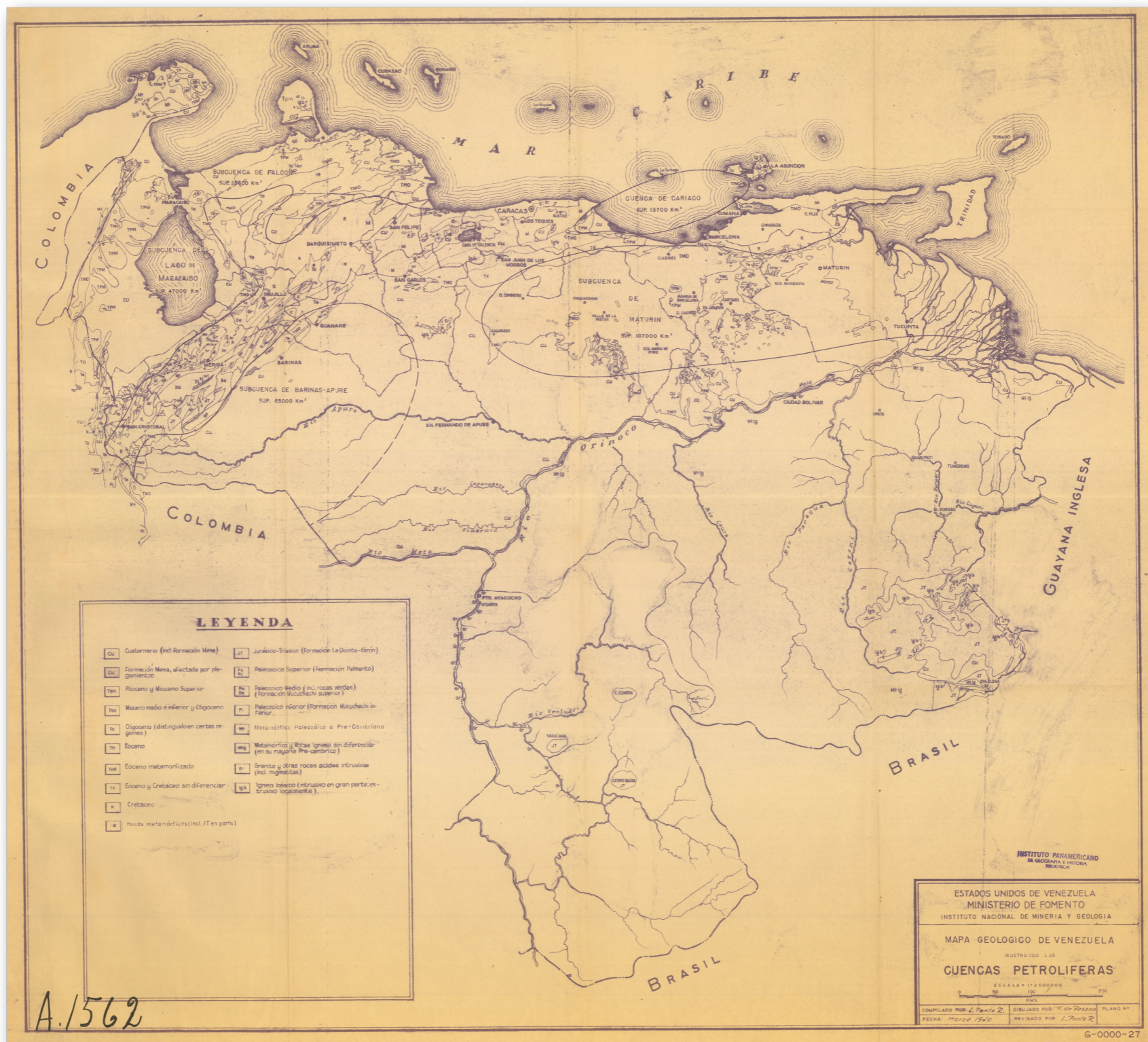
Figure 4.3. [Original Map] United States of Venezuela, Ministry of Promotion, Geological Map of Venezuela (March 1950)