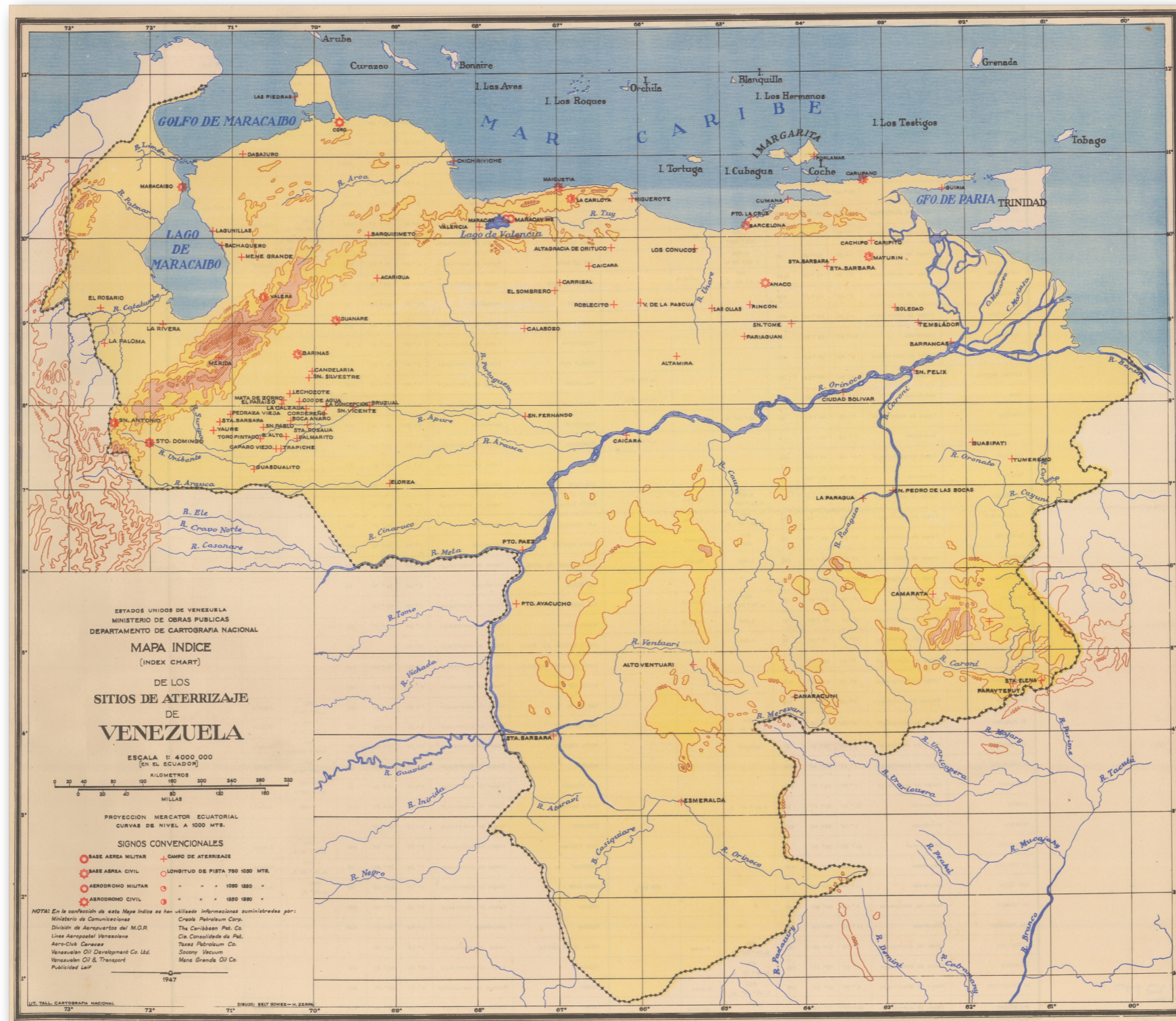
Figure 4.2. [Original Map] United States of Venezuela, Ministry of Public Works, Index Map of Venezuela's Landing Sites (1947)