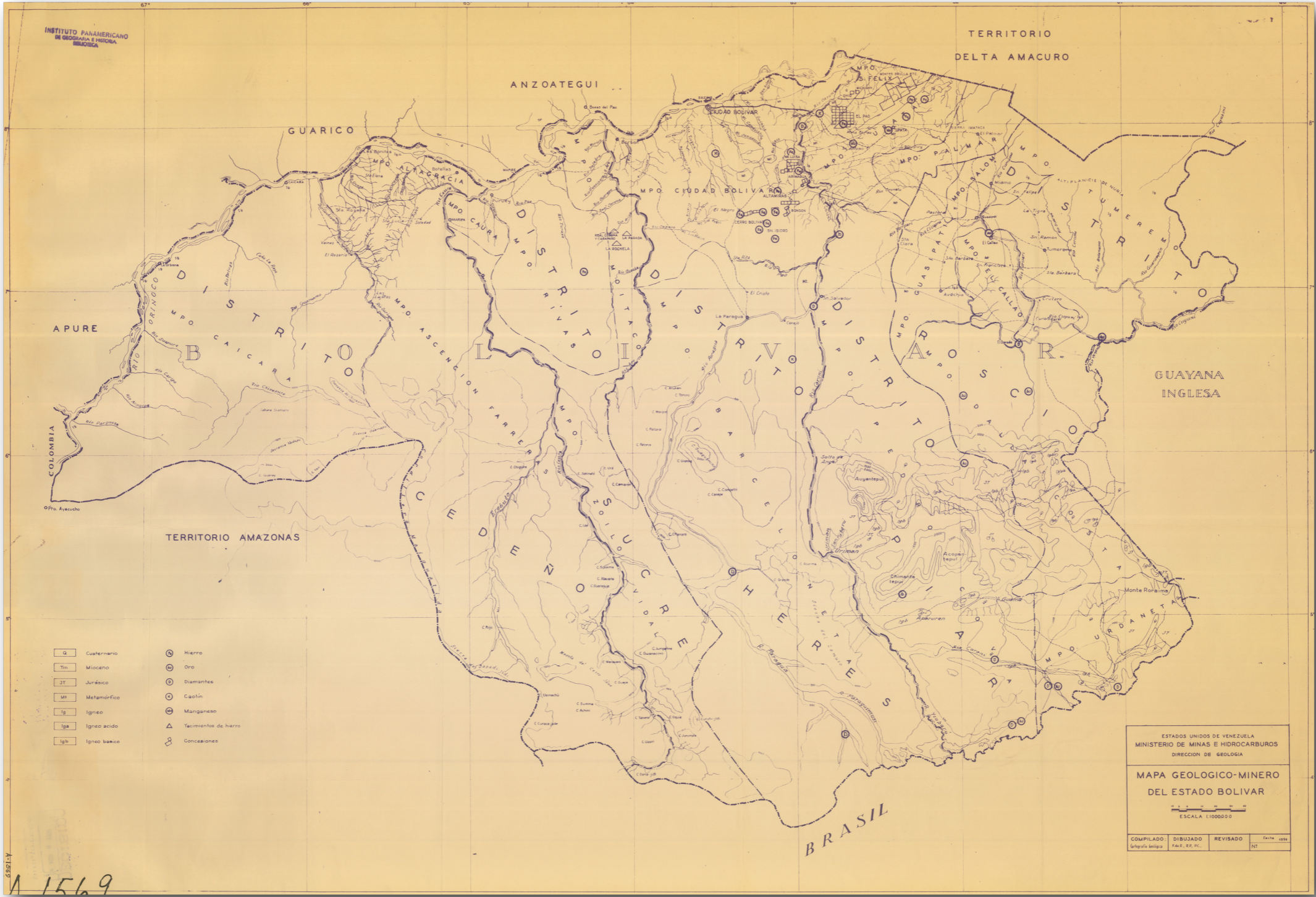
Figure 4.5. [Original Map] United States of Venezuela, Ministry of Mining and Hydrocarbons, Geology Directory, Mining and Geological Map of the State of Bolivar (1950)