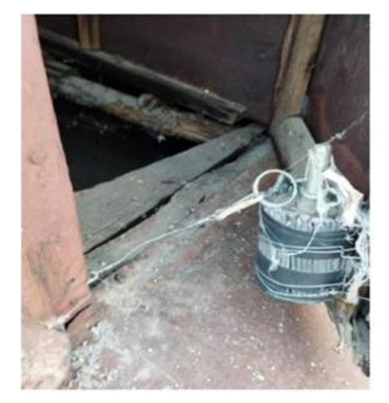
Figure 4: Grenade Installed in Door Entryway in Lachin District<sup>40</sup>