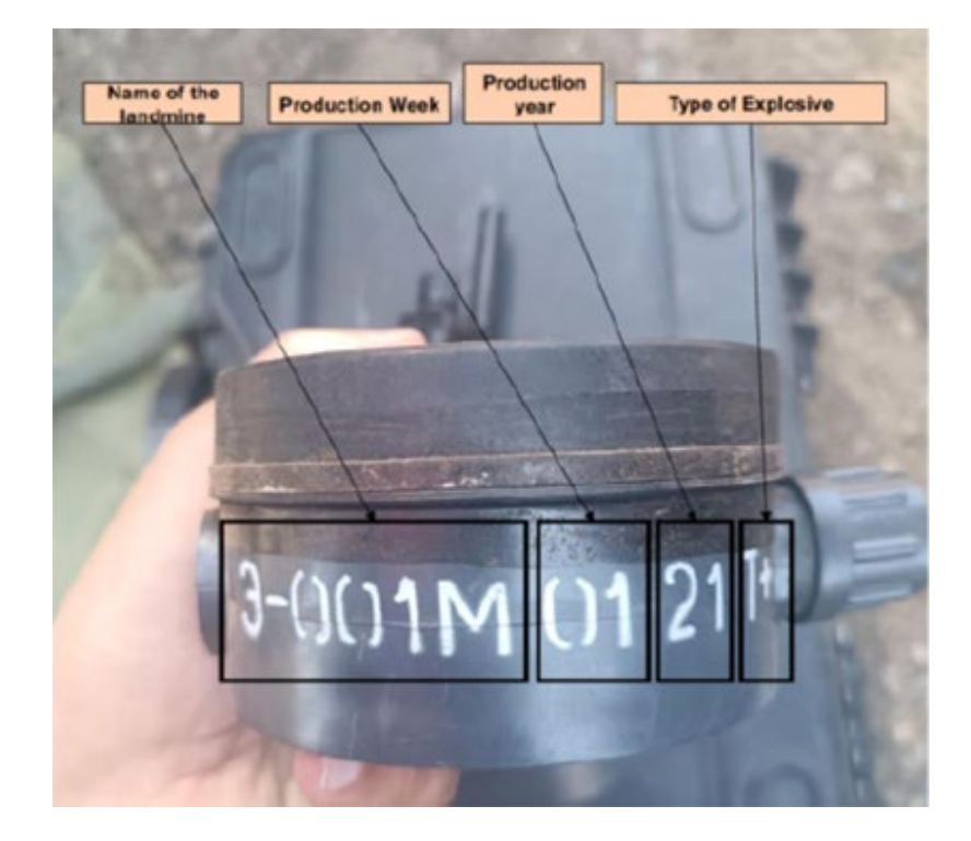
Figure 1: Landmine found in Lachin District<sup>21</sup>

14. Armenia was required in the Trilateral Statement to withdraw its forces in parallel to the deployment of the Russian Federation peacekeepers<sup>22</sup>. Despite this, Armenia's forces have continued to operate within Azerbaijan's sovereign territory in violation of the Trilateral Statement, as the Secretary of Armenia's Security Council, Armen Grigoryan, has conceded<sup>23</sup>.