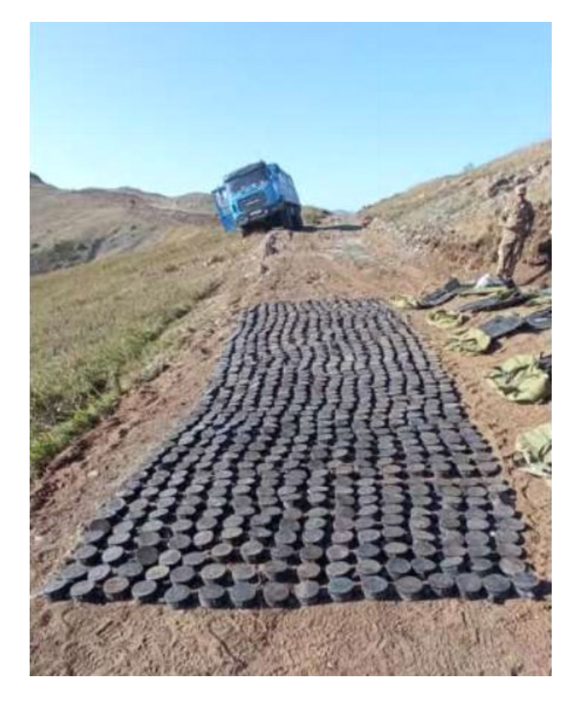
Figure 2: Landmines found near Ikinji Ipak and Birinji Ipak settlements in August 2022<sup>31</sup>