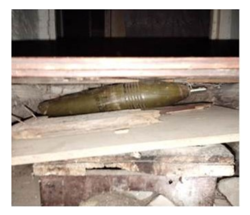
Figure 3: Explosive Device Installed Underneath Entry way Floorboard in Lachin District<sup>39</sup>