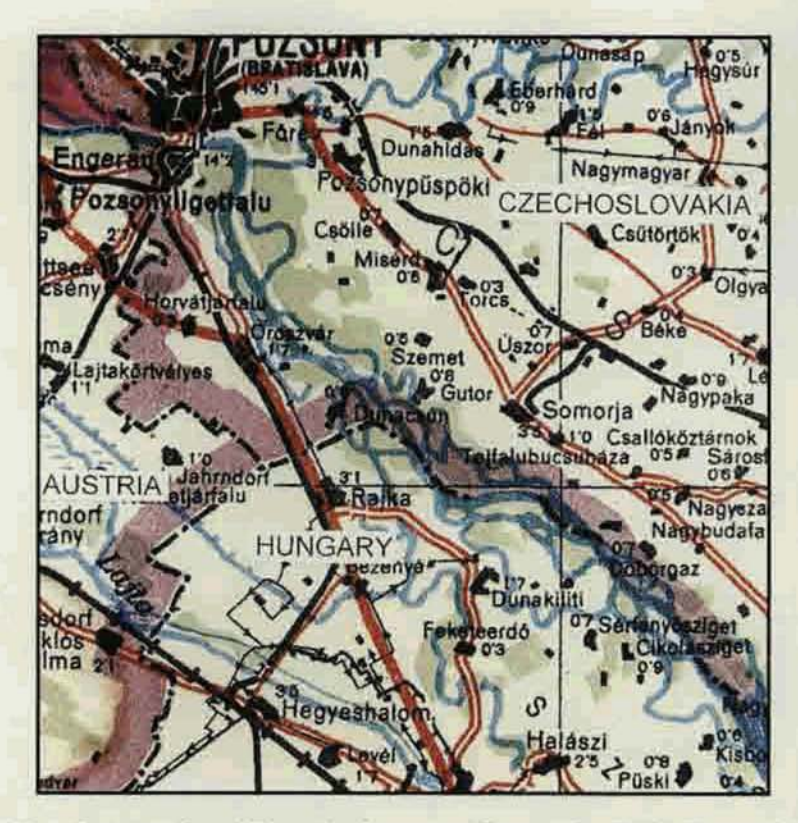
Plate 1b International Boundaries according to the Paris Treaty (1947) showing the Cessation of the three Villages

Plate 1a International Boundaries according to the Trianon Treaty (1921) Excerpt of General map of Hungary, edition of the Hungarian Royal Ordnance Survey, 1930, original scale: 1:750,000